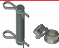
PIN & BUSHING KIT